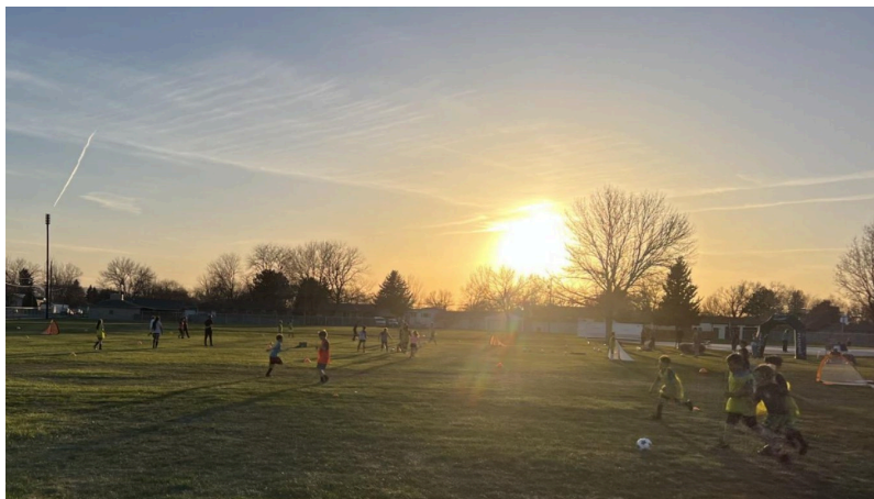
Photo: Future Kids Soccer Program at Scottsbluff

Here we are again – winding down an activity filled summer and poised at the start of another school year, full of all the hope and optimism that comes with new beginnings.