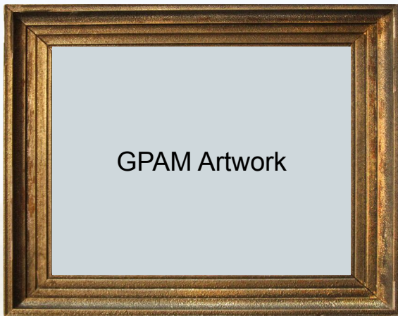
Relative Position , 2013 Mixed media