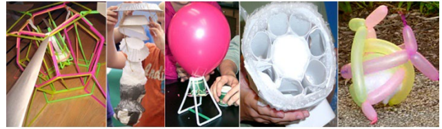
EGG DROP EXPERIMENT can you keep an egg from breaking?